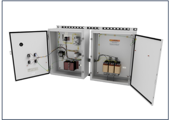
* shown as ETL Listed Double Enclosure