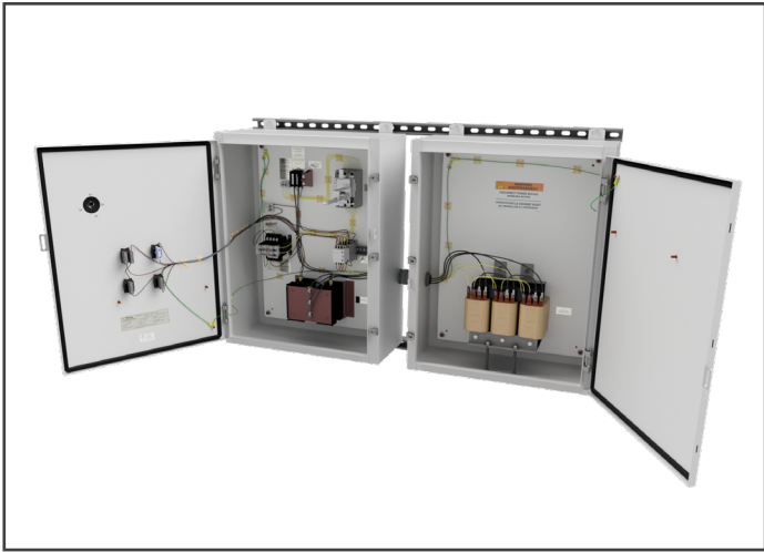
* shown as ETL Listed Double Enclosure