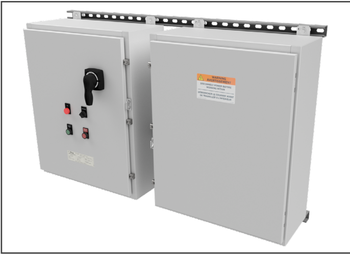
* shown as ETL Listed Double Enclosure