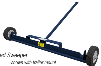
Dings Tireguard Magnetic Road Sweeper