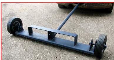
Dings Tireguard Magnetic Road Sweeper