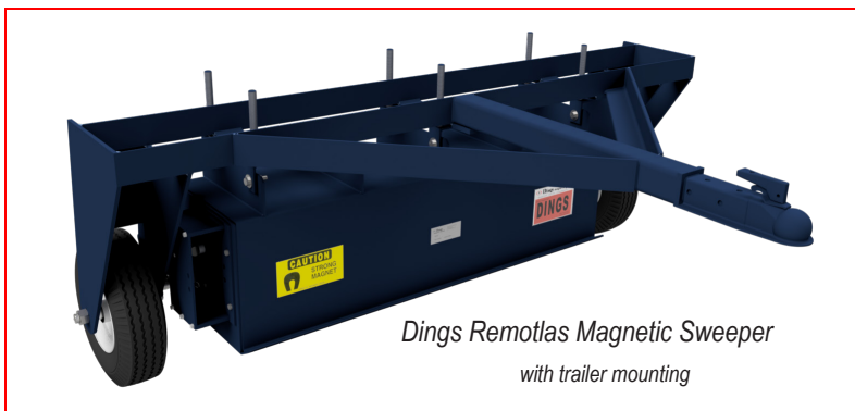
Dings Remotlas Magnetic Sweeper with trailer mounting

Dings Remotlas Magnetic Road Sweepers are available in bracket mount, trailer type mount and forklift mounting options. A driver can unload metal debris without leaving his vehicle. A battery-operated switch mounts next to the driver inside the cab, saving time by eliminating manual unloading. A simple flip of the switch is all it takes to switch from sweeping to unloading!