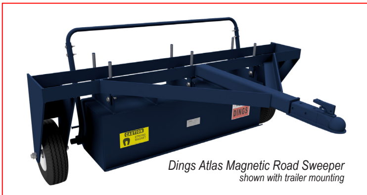
Dings Atlas Magnetic Road Sweeper shown with trailer mounting

Dings Atlas Magnetic Road Sweepers are available in bracket mount, trailer type mount and forklift mounting options. A horizontal handle on the housing releases the load of metal debris, eliminating wiping or had contact with metals. The handle telescopes outward for better leverage when releasing the load. To move away from discharged metal, the handle can be locked in release (non-pickup) position.