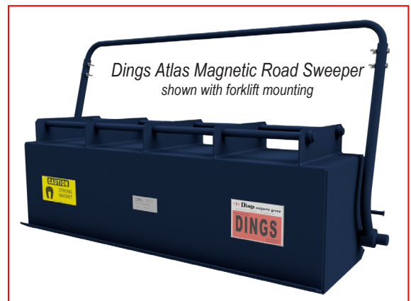
Dings Atlas Magnetic Road Sweeper shown with forklift mounting

● Call Us For Expert Support of Dings Co. Magnetic Group Equipment - Regardless of its Age