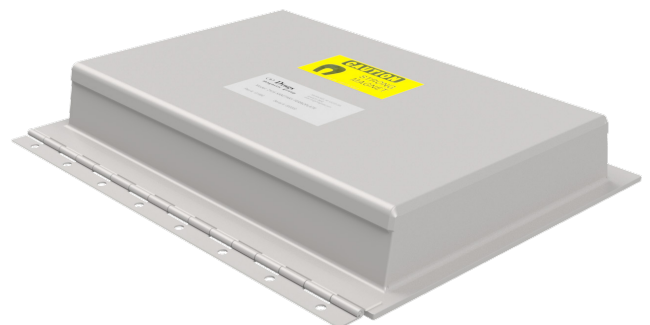
Shown with sanitary finish & stainless-steel back