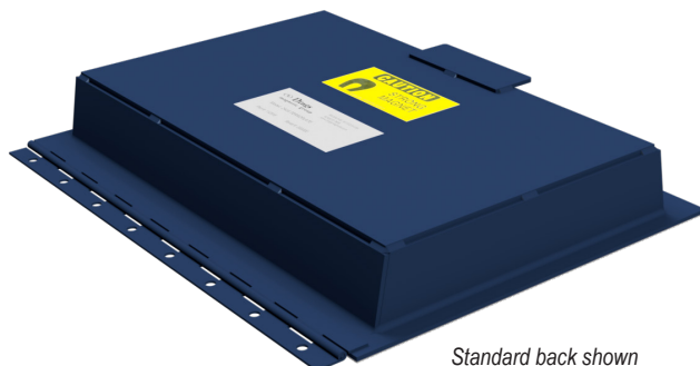
Standard back shown